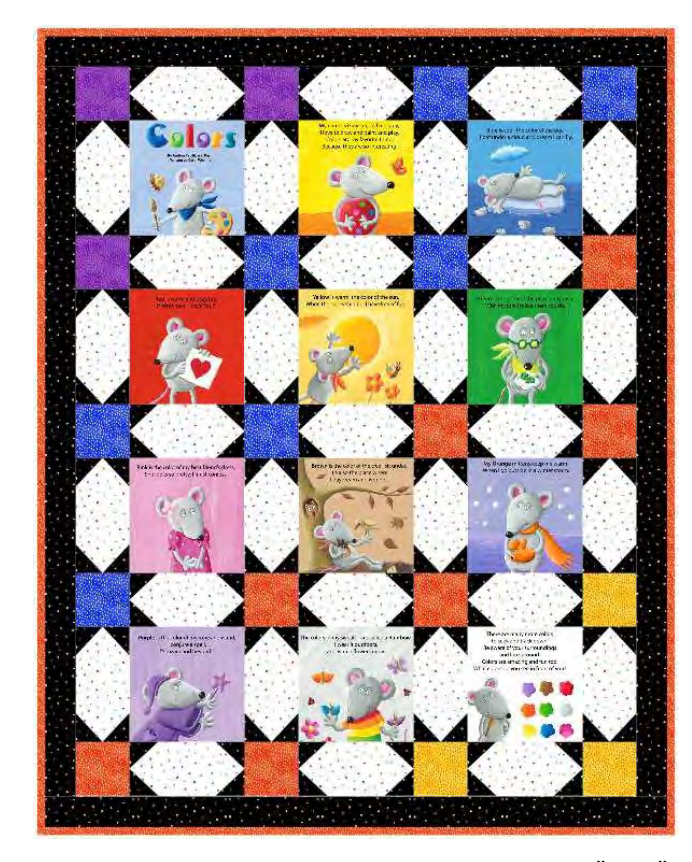
41" x 52"